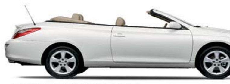
SLE V6 Convertible in Blizzard Pearl

Within the next 30 days , I will be driving my new Toyota SLE V6 Convertible: